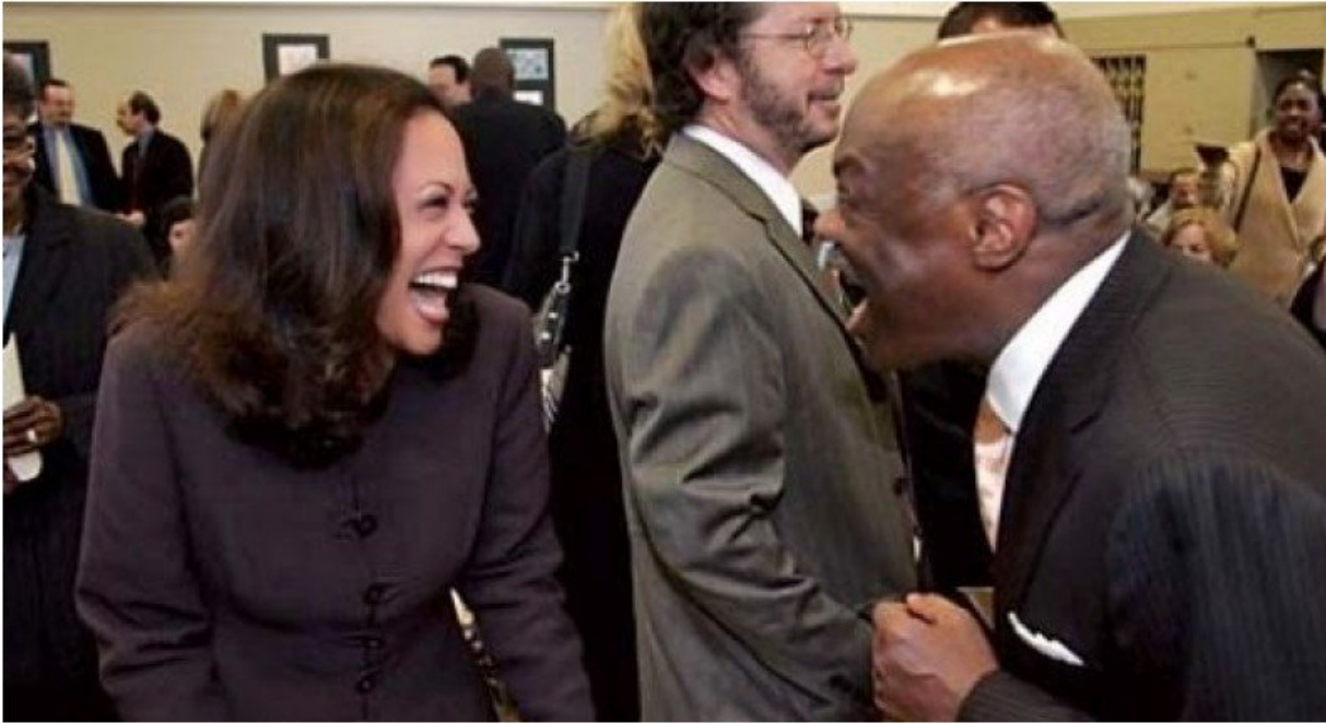
Kamala Harris and Willie Brown

Kamala Harris was grandstanding again as she tried to bully Attorney General Jeff Sessions on Capitol Hill. Sessions, with his smooth southern drawl, outsmarted and outclassed Harris, who came off as a screaming shrew, and it's no wonder with her tawdry past. Harris has a dirty little sex secret that is coming back to haunt her, but that's not all. She has a long line of corrupt deals, one with Maxine Waters, that helped her get power and stay in power.