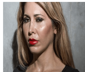
One Thing All Liars Have in Common, Brace Yourself TruthFinder