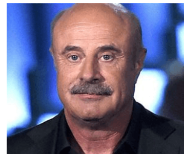
Dr. Phil Mourns As Tragedy Is Confirmed thegraylines.com

– George Papadopoulos (@GeorgePapa19) September 18, 2018