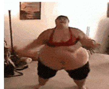
You Won't Believe Her Transformation Keto Diet

You can tell by the actions of the Democrat Party and deep state operatives this week.