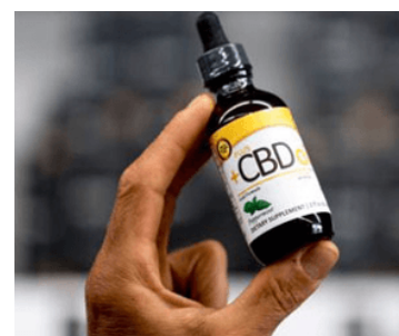
Baffled Doctors Now Recommend CBD LifeStream CBD