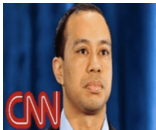
Sad News for Tiger Woods Now The PGA Wants Him Gone