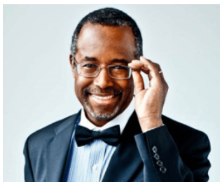
Carson's $5 Memory Booster Cures Brainfog Todays News